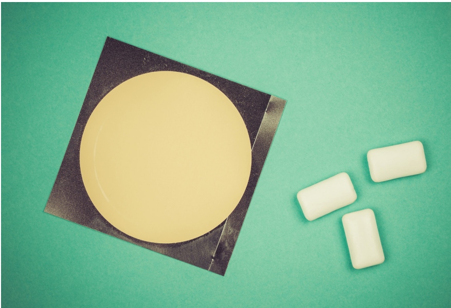
Nicotine patch and gum